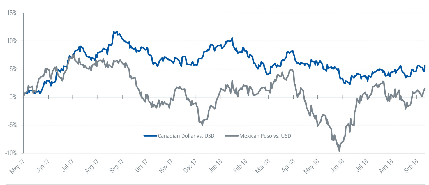
Chart of the Month: NAFTA's Wild Currency Ride

On May 18, 2017, a notice of intent was submitted to Congress to renogiate NAFTA. Since then, negotiations have collapsed, progressed, been put on hold, with President Trump threatening to kill NAFTA more than a few times. The risk of a NAFTA collapse impacted monetary policy decisions from both Canada and Mexico and caused major swings in their currencies against the U.S. dollar during this tumultuous time. On September 30, 2018, the U.S., Canada and Mexico reached a deal to revamp NAFTA, via the U.S.-Mexico-Canada Agreement, or USMCA. The Chart of The Month illustrates the return of both the loonie and the Mexican peso against the greenback during the NAFTA negotiations, and the ups and downs in the currencies is a clear reflection of the ups and downs in the process.