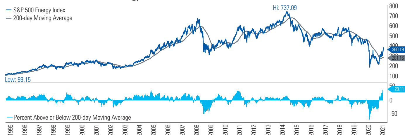
Chart of the Month: Wild Ride for the Energy Sector

It's been a wild ride for the energy sector over the last year. The S&P 500 Energy Index tumbled over 50% from February 5 to March 18, 2020, as the coronavirus pandemic and the breakdown between OPEC+ and Russia caused oil prices to plummet. The sector has rebounded since then, up over 70% from the March low, and is trading close to 30% above its 200-day moving average - the most ever going back three decades. While this may seem like a bearish technical indicator, the sector has historically produced above-average returns during the year following a period when it trades at 20% or more above its 200-day moving average, according to LPL Research. In other words, momentum often breeds more momentum. Considerable uncertainty remains due to COVID-19, but if history is any indication, the energy sector could continue its momentum for the foreseeable future.